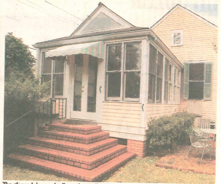
The glassed-in porch allows Jacqueline 'Quack' Avegno to watch her grandsons play in her yard.

days. At one point she had a trampoline for them; now, a concrete pad where a workshop used to be is convenient for a basketball court.