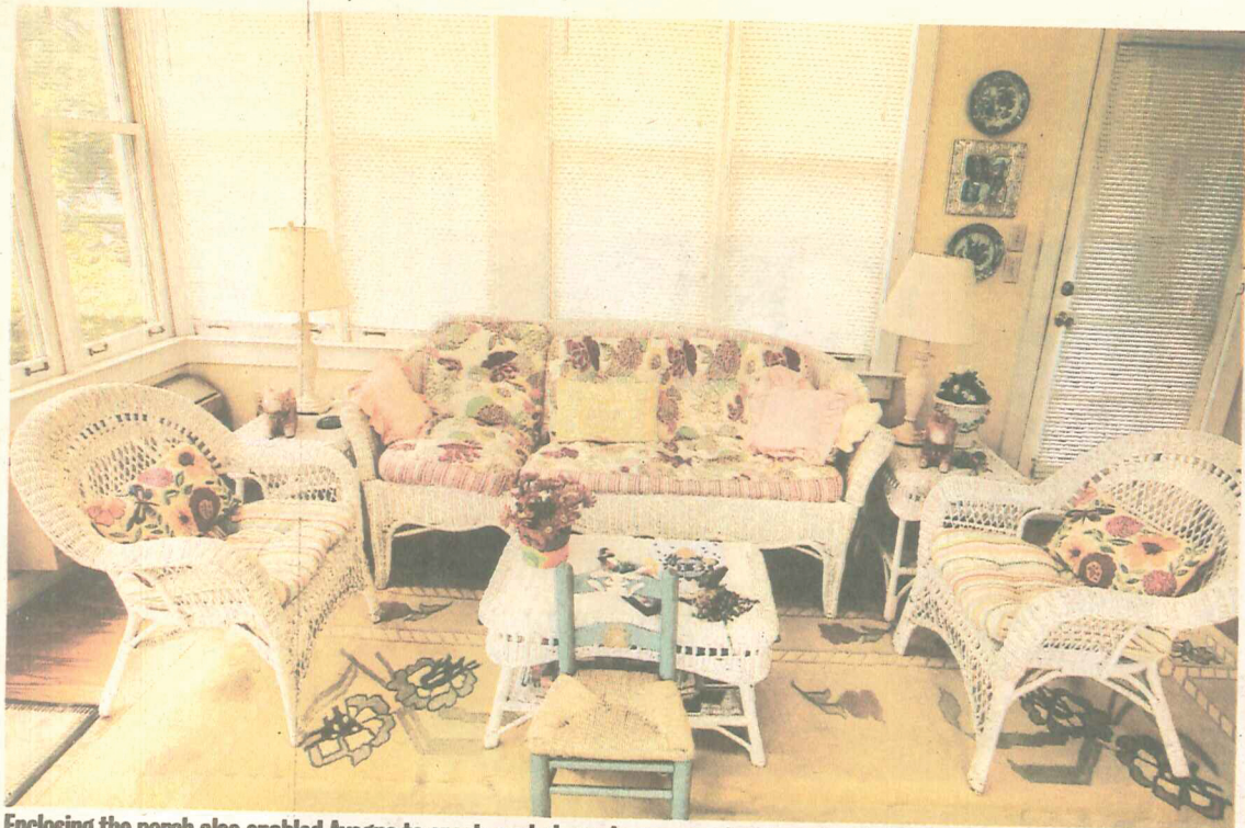
Enclosing the porch also enabled Avegno to create an indoor play space when her grandsons visit on rainy days.